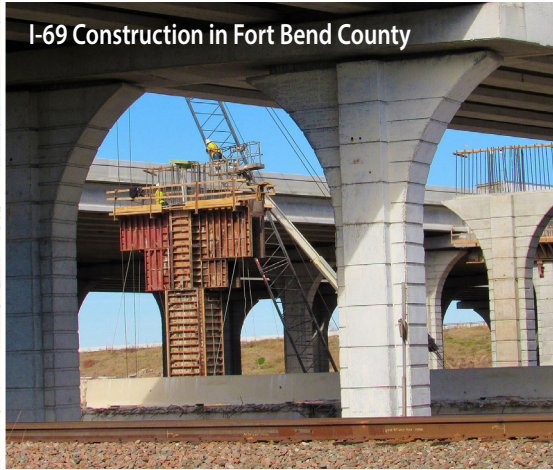
I-69 Construction in Fort Bend County